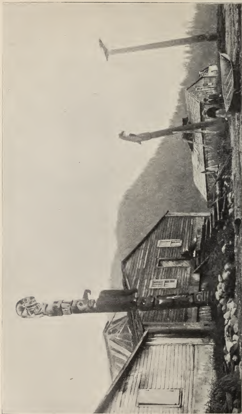
INDIAN DWELLINGS AND TOTEM POLES, FORT WRANGLE, ALASKA.